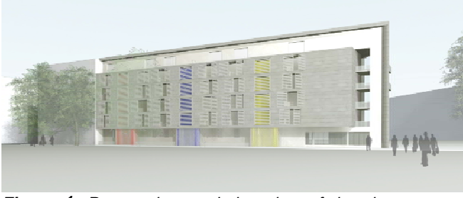
Figure 1: Perspective rendering view of the six storey timber building to be constructed in Florence