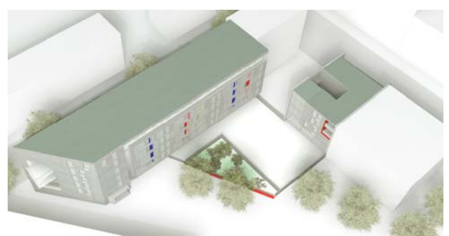
Figure 2: Perspective rendering view of the six and four storey building

The building shape will be that of a modern architecture, with a special care for architectural features and perfectly integrated in the surrounding urban context. The exterior cladding (plaster and ventilated woodcement cladding) will cover the wooden structures, which will be left uncladded, as a witness of the wooden skeleton of the building, only in the inside front-office at the ground floor, behind a glass cover.