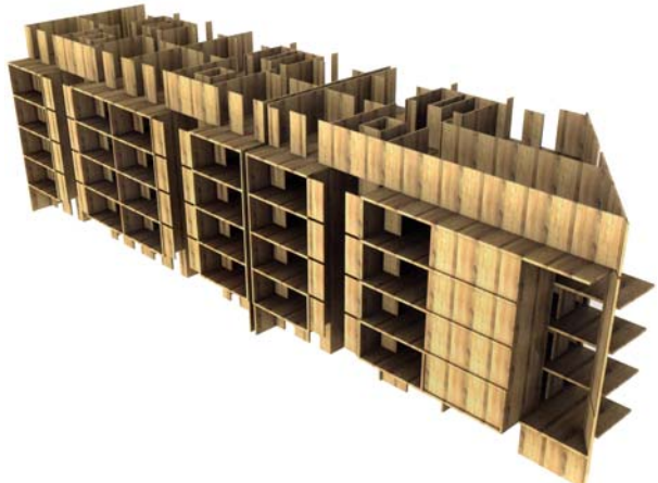
Figure 5: Perspective rendering view of the timber crosslaminated structure of the six storey building

The structural system chosen for the construction is a new system, which, in spite of his relatively new diffusion, is already nowadays the most used for the construction of multi-storey timber buildings in Europe (in 2008 a nine storey cross-laminated timber building have been constructed in Murray Grove, London, which is not a seismic area). As it is witnessed by the results of recent experimental researches on full scale multi-storey buildings made by Italian and Japanese researchers, to the natural features of lightness, strength and flexibility of other timber construction systems, the cross-laminated timber system join an excellent level of ductility, capacity of dissipation of energy and safety against seismic actions.